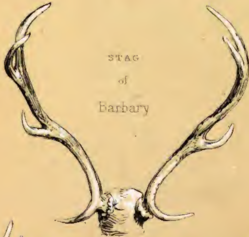
STAG of Barbary